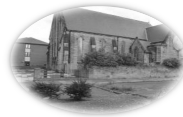
St. ANTHONY'S Welbeck Road, Walker