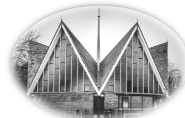
St. TERESA'S Heaton Road, Heaton