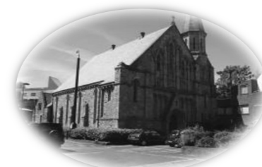
St. LAWRENCE'S Byker Crescent, Byker