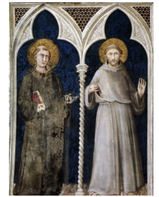
St Anthony of Padua & St Francis Walker