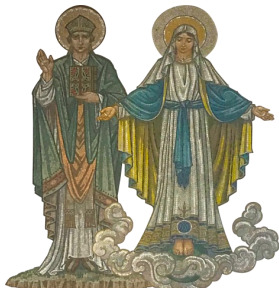
Our Lady & St Columba Wallsend

Carville Road, Wallsend, NE28 6 RJ Our Lady and St Columba Tel 0191 2623882 www.ourladyandstcolumbawallsend.org.uk e-mail: wallsend.ourladystcolumba@rcdhn.org.uk Ss Anthony & St Francis Tel 0191 262 3817 www.stanthonystfrancis.org.uk e-mail: newcastle.stanthony@rcdhn.org.uk