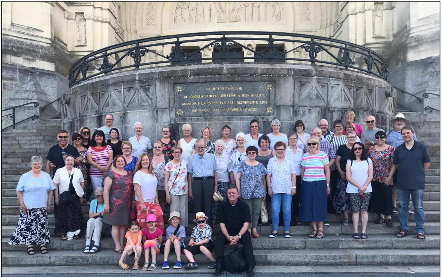
Pilgrims arrived safely at Lisieux (Normandy) famed as the place where St. Therese (a 19 th Century Saint) also known as ‘the Little Flower’ spent most of her childhood and an important French pilgrimage site.