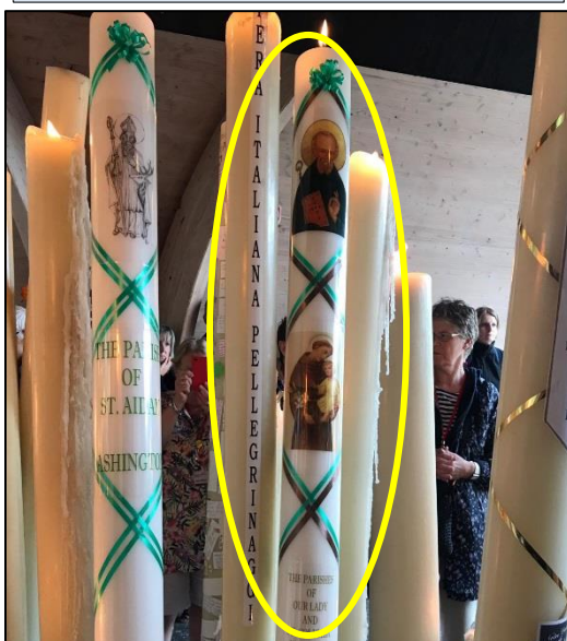
Our 'Prayer Candle' for St. Anthony of Padua & St. Columba's Parish burns brightly and all our intentions raised for the intercession of Our Lady.